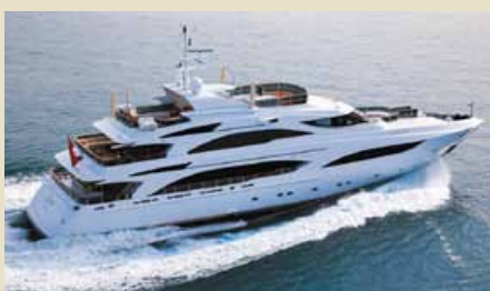
DIANE 43.00 m 10/8 West Mediterranean 154,000/133,000 €/week