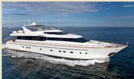
SYNERGY 30.70 m 10/5 West Mediterranean 52,500/45,500 €/week