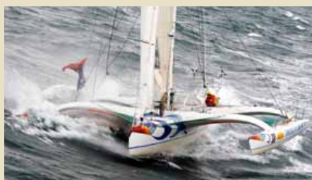
BRANEC Cruiser Racer Trimaran 15.24 m 1990 Location: West France 200,000 €