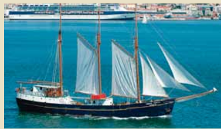
PRINCIPE PERFEITO 3 Mast Schooner 41.52 m 1943 Location: Portugal 1,650,000 €