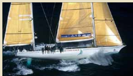
NEW ZEALAND ENDEAVOUR Racing yacht 25.73 m 1993 Location: Italy 190,000 €