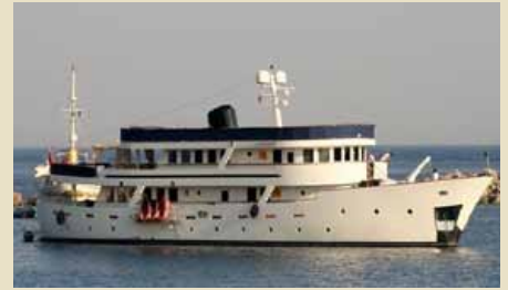
LA SULTANE 34.10 m 12/5 East Mediterranean 47,000 €/week