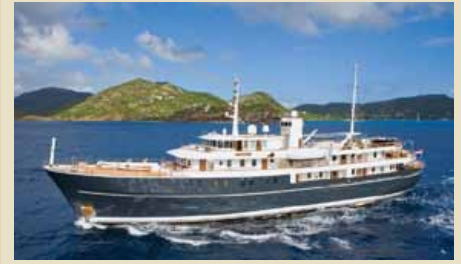
SHERAKHAN 69.95 m 26-36/19 West Med. & Croatia 385,000 €/week