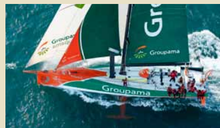
GROUPAMA 70 VOR 70 21.50 m 2008 Location: Lorient, France 650,000 €