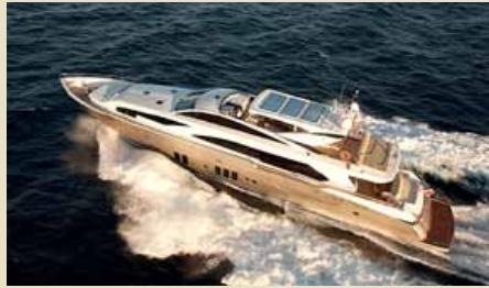
MAYAMA 37.00 m 10/6 Croatia 99,000/85,000 €/week