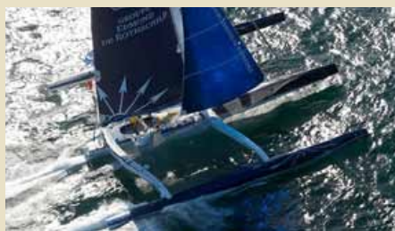
GITANA 11 77ft Trimaran 23.38 m 2001 Location: Lorient, France 1,320,000 €