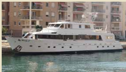
ATTILA Steel Motor Yacht 30.00 m 1989 Location: South France 350,000 €