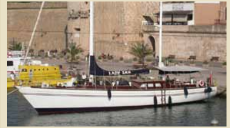
LADY SAIL 84ft Marconi Ketch 25.65 m 1976/1999 Location: Turkey 500,000 €