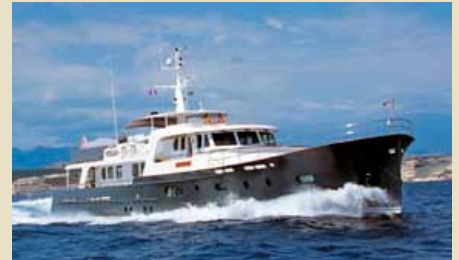
ALEXANDRIA 33.00 m 10/5 West Mediterranean 35,000/25,000 €/week