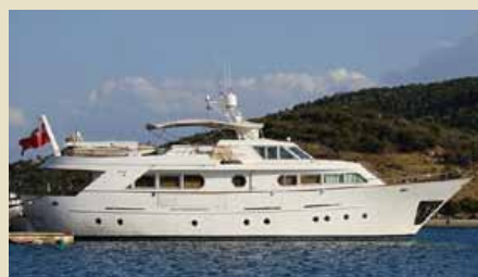
KIA ORA C 78ft Classic Benetti 24.00 m 1986/2006 Location: Turkey 1,485,000 €