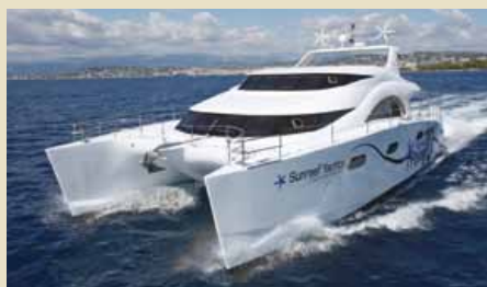
JAMBO 24.00 m 8/2 Pacific Ocean 30,000 €/week