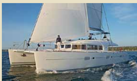
VACOA 18.90 m 10/3 West Mediterranean – Caribbean 33,600/24,000 €/week