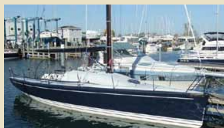
KATANGA Farr 40 12.41 m 2000 Location: Grenada US$ 90,000