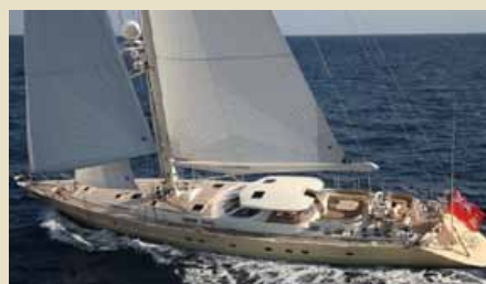
CELANDINE Jongert 2900 M 29.73 m 1993 Location: East Medit. 2,900,000 €