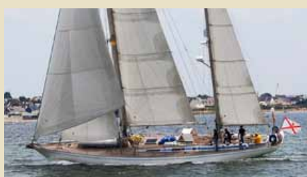
CASSIOPEIA Swan 65 19.68m 1975 Location: Brittany, France 400,000 €