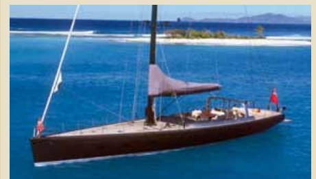
WALLY B 32.72 m 6/5 East/West Mediterranean 56,500/45,000 €/week