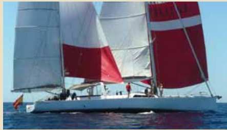
FORTUNA Maxi 82 Ketch 25.40 m 1989/2005 Location: Spain 495,000 €