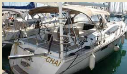
CHAI Jeanneau 57 17.78 m 2011 Location: South France 630,000 €