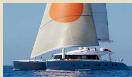
MAITA'1 22.56 m 9/4 Caribbean 42,000 34,000 USD/week