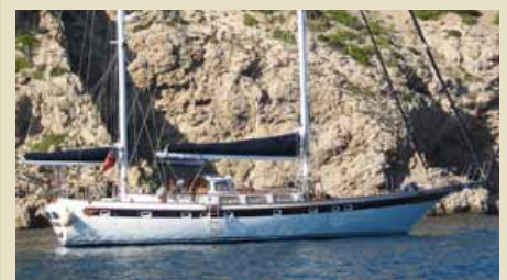
BIG MOMMA Formosa 58 20.00m 1982 Location: South France 250,000 €