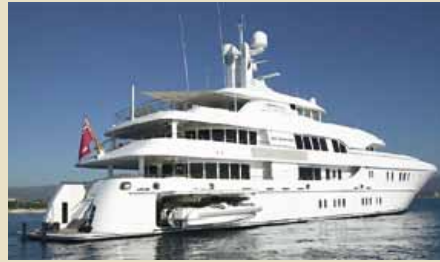
SOLEMATES 60.00 m 12/15 West Mediterranean 520,000/450,000 €/week