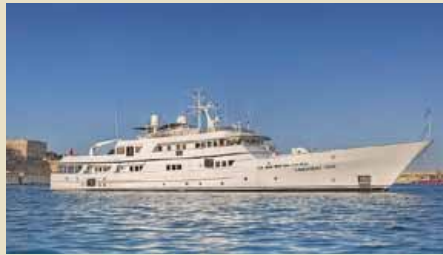
SANSSOUCI STAR Classic Motor Yacht 53.53 m 1982 Location: Baltic Sea Price on application