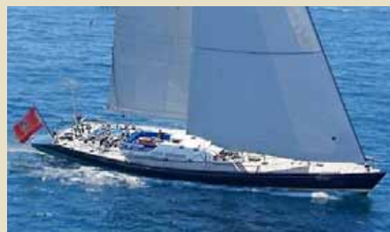
BAIURDO VI 34.80 m 6/4 East Mediterranean/Caribbean 41,000/38,000 €/week