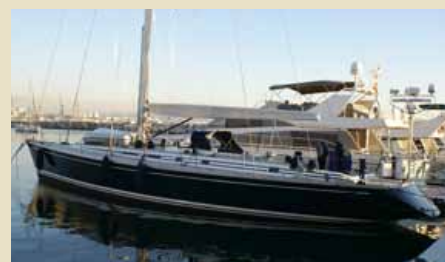
SEAWOLF 3 19.82 m 6/2 West Mediterranean 18,000/15,000 €/week