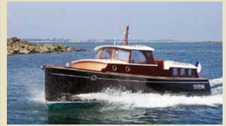
LOCH LOMOND Classic Tender 9.00 m 2007 Location: West France 150,000 €