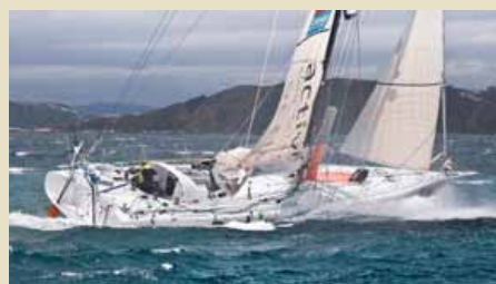
SPIRIT OF CANADA Open 60 ECO Class 18.28 m 1997 Location: East Canada 159,000 €