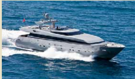
MY SPACE 34.00 m 10/6 West Mediterranean 75,000/68,000 €/week