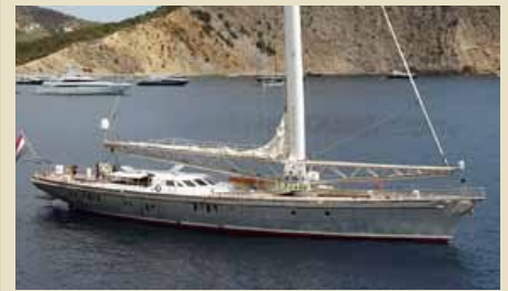
DWINGER 48.50 m 11/7 West Mediterranean – Caribbean 75,000/65,000 €/week