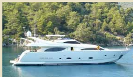
PRINCIPESSA Ferretti Custom Line 94 Fly 28.80 m 2005 Location: Turkey 3,300,000 €