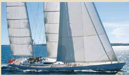
MARI-CHA III 147' Luxury Ketch 44.72 m 1997 Location: West Medit. US$ 12,950,000