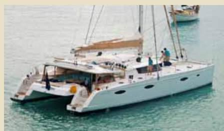
WORLD'S END 19.81 m 10/3 East Mediterranean 26,000/24,000 USD/week