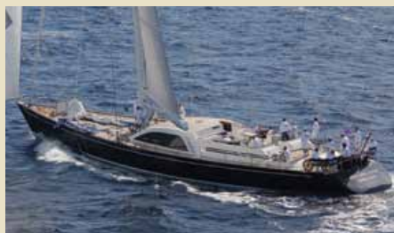
HIGHLAND BREEZE 34.34 m 6/5 West Mediterranean – Caribbean 52,000/46,000 €/week