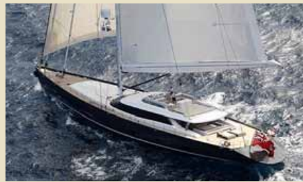
RED DRAGON 51.70 m 8/10 East Mediterranean 175,000 €/week