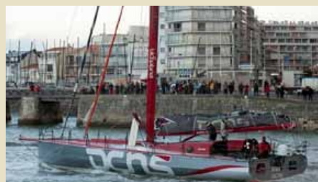
DCNS Open 60 IMOCA Class 18.28 m 2008 Location: Lorient, France 500,000 €