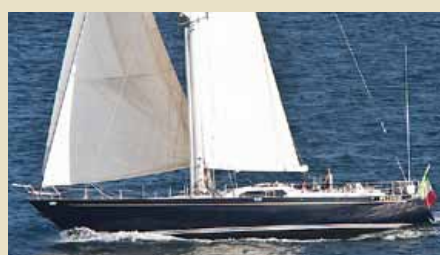
KINZANA GEM 610 19.26m 1989 Location: Cagliari, Sardinia 395,000 €