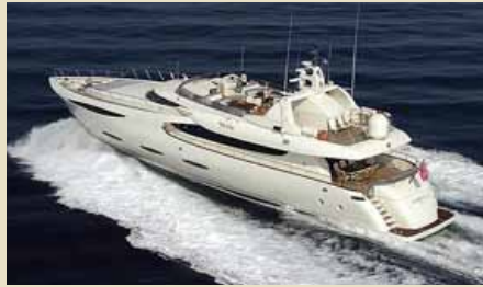
MABRUK III 35.00 m 10/6 West Mediterranean 57,000/52,000 €/week