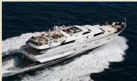
ANTISAN 33.00 m 12-40/6 West Mediterranean 56,000/45,000 €/week