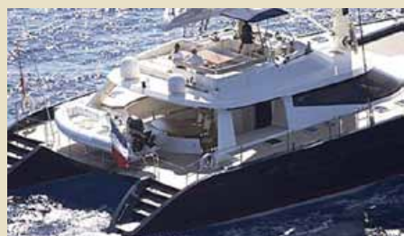
NAHEMA IV 21.95 m 8/3 Caribbean 38,500 USD/week