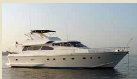
CELESTIAL Navarcantieri P 21 S 22.60 m 1997 Location: South France 325,000 €