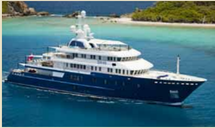
POLAR STAR 63.40 m 12/17 West Mediterranean 420,000/380,000 €/week