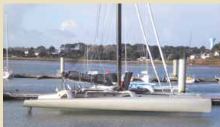
PARADOX Fast Cruising Trimaran 18.90 m 2010 Location: West USA 1,190,000 €