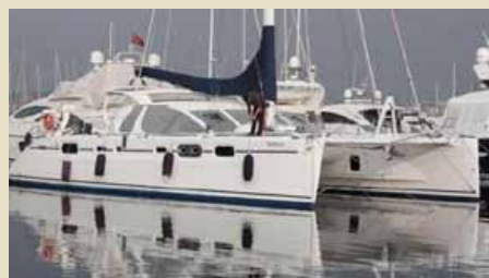
RODEO Catana 582 17.50 m 2005 Location: Turkey 800,000 €