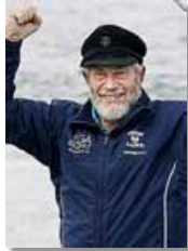
Sir Robin Knox-Johnston