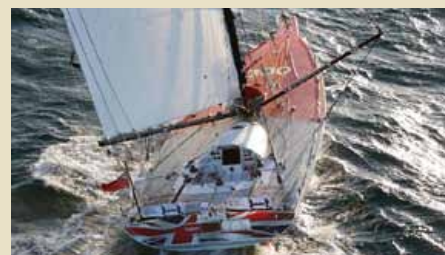
SPARTAN, ex SAGA Open 60 IMOCA Class 18.28 m 1997 Location: South England 200,000 GBP