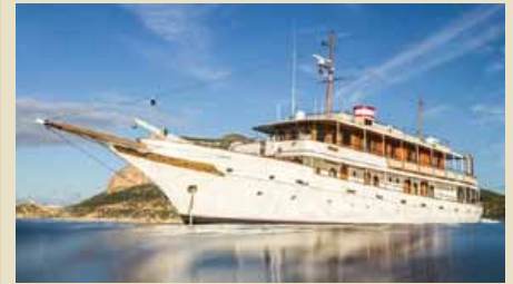
TEOREM 141' Neo Classic Motor Yacht 43.00 m 1994/2005 Location: South France 3,500,000 €