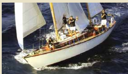
ALTAIR 42ft Classic Ketch 12.80 m 1968 Location: Brittany, France 125,000 €