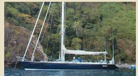
SILANDRA Nauto 70 21.33 m 1991 Location: Caribbean US$ 750,000