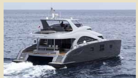
EWHALA 18.90 m 8/2 West Mediterranean 22,000/26,000 €/week