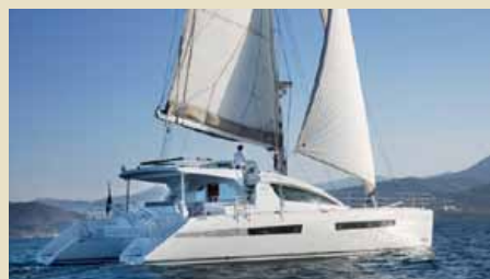
ETANA Privilege 615 18.50m 2007 Location: Valencia, Spain 850,000 €