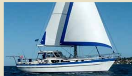
LADY IN WHITE 59ft Blondecell Cutter 16.90 m 1996 Location: Uruguay 330,000 €