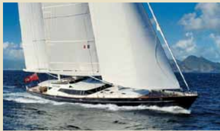
Name: DRUMBEAT Length: 53.00 m Guest/Crew: 11/10 Area: South Pacific – South East Asia Rate (high/low): 230,000 USD/week