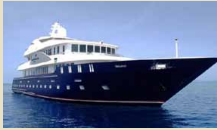
DHAANKAN'BAA 40.00 m 14/18 Maldives 115,000/100,000 USD/week