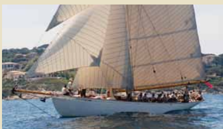
MOONBEAM OF FIFE III Gaff Cutter 31.00 m 1903 Location: South France 1,950,000 €