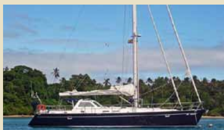
LACARABA Adams 52 16.00 m 1998 Location: South France 250,000 €