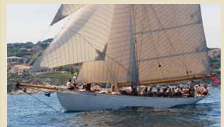
MOONBEAM III 31.00 m 6-12/2 West Mediterranean 42,000 €/week