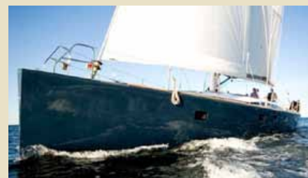
MITI Sunreef 60 18.20 m 2006 Location: South France 490,000 €