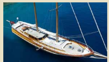
EYLUL DENIZ II 30.35 m 8/5 East Mediterranean 28,000/25,200 €/week