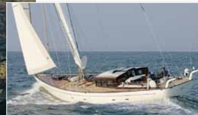
Atao, p. 6