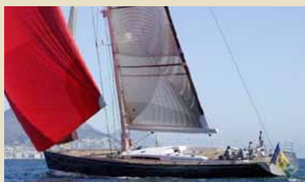
Mrs SEVEN 30.20 m 8/4 West/East Mediterranean – Caribbean 52,000/46,000 €/week