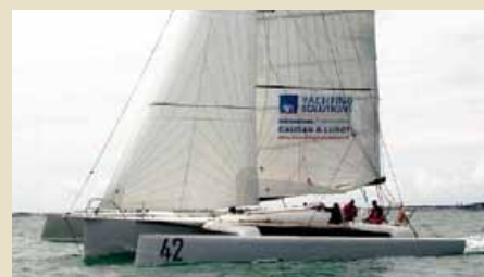
KRYSSALID 42ft racing trimaran 12.70 m 2006 Location: West France 150,000 €