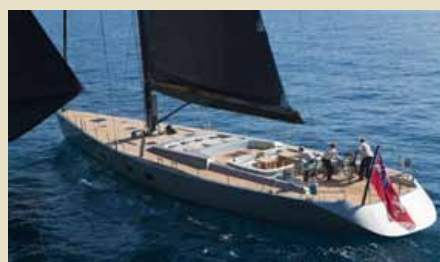
DARK SHADOW 30.45 m 6/5 West Mediterranean 50,000 €/week