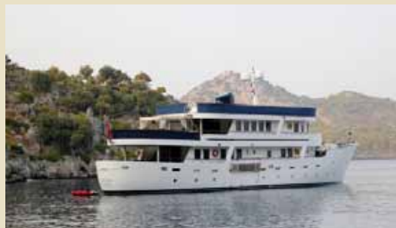
LA SULTANE Neo Classic Motor Yacht 34.10 m 2006 Location: Turkey 2,800,000 €