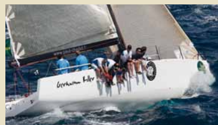
GERANIUM KILLER A40 RC 11.98 m 2008 Location: South France 140,000 €