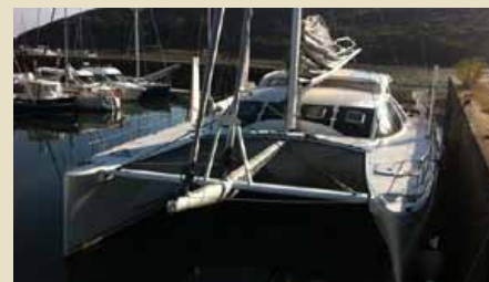
SAINT NICOLAS DE SAUZON III Catana 582 17.70 m 2001 Location: Brittany, France 835,000 €