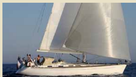
BLUE MOON II Sweden 45 14.15 m 2006 Location: South of France 330,000 €