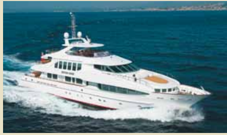
SEVEN SINS 41.30 m 10/7 West Mediterranean 120,000 €/118,300 USD/week