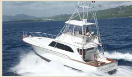
LIMITED EDITION Buddy Davis 47 Fly SF 14.30 m 1989/2009 Location: Caribbean 345,000 €