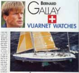
Vendée Globe 1992