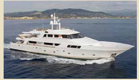
SENSEI 39.00 m 10/7 West Mediterranean 98,000/78,000 €/week