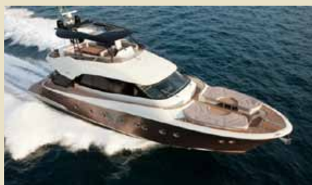
ESMERALDA OF LONDON 22.00 m 8/2 Adriatic Sea 28,000/32,000 €/week