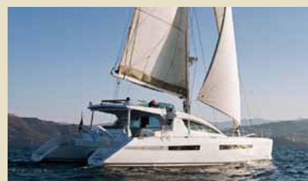
ETANA 18.50 m 9/2 West Mediterranean 24,000/22,000 €/week