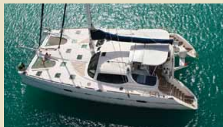
OCEAN'S SEVEN Privilege 585, Catamaran 17.82 m 2004/2007 Location: Turkey 595,000 €