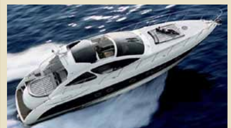
DELAUR II Atlantis 55 16.70 m 2005 Location: South France 242,000 €