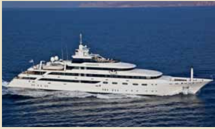
Name: O'MEGA Length: 82.50 m Guest/Crew: 30/30 Area: East & West Mediterranean Rate (high/low): 525,000 €/week