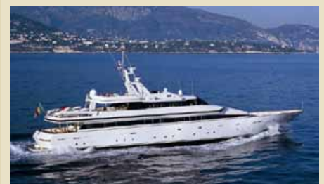
COSTA MAGNA 44.50 m 10/9 West Mediterranean 96,000/90,000 €/week