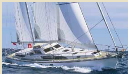
LAZY JACK Amel 54 17.20 m 2008 Location: West France 660,000 €