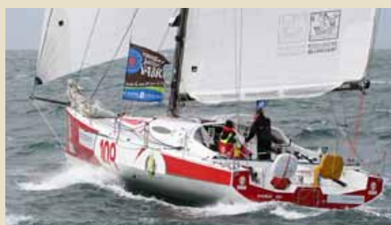
MASAI Pogo 40 12.18 m 2011 Location: Lorient, France 240,000 €