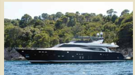
BJORG II Guy Couach 2800 LR 28.00 m 2002 Location: Spain 1,350,000 €