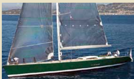
GENIE 24.00 m 6/3 West Mediterranean 30,000/25,000 €/week