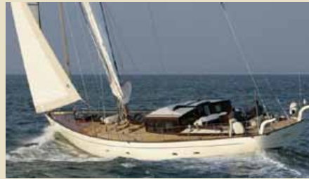
ATAO Neo-classic JFA Yachts 24.90m 2006 Location: Caribbean 2,950,000 €