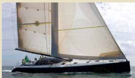
OURSON RAPIDE 60ft Multiplast Fast Sloop 18.28 m 2009 Location: Antibes, France 1,250,000 €