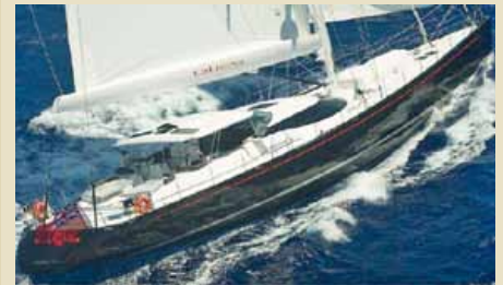
BLISS 37.00 m 10/5 South Pacific 98,000/92,000 USD/week