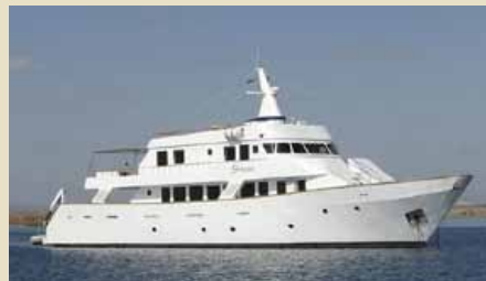
SHERAZADE Motor Yacht (Diving Charter) 32.15 m 2006 Location: Egypt 800,000 €