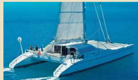
MAGIC CAT 25.00 m 8/4 East & West Mediterranean 35,000/30,000 €/week