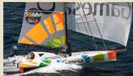
GAMESA Open 60 IMOCA Class 18.28 m 2007 Location: England 985,000 €