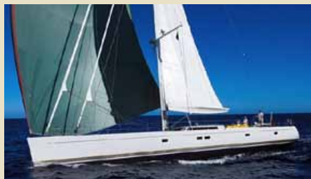
WHIMSY Custom Performance Sloop 23.98m 2005 South France/Malta 2,450,000 €