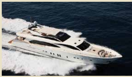
LADY EMMA 34.10 m 8/4 South of France 78,000/72,000 €/week