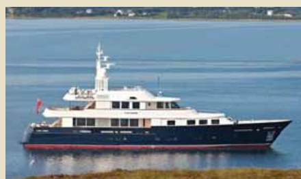
CALLIOPE 42.28 m 10/9 Croatia 190,000 USD/week