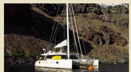
CHARLOTTE Sunreef 62 18.90m 2008 Location: Tunisia 1,100,000 €