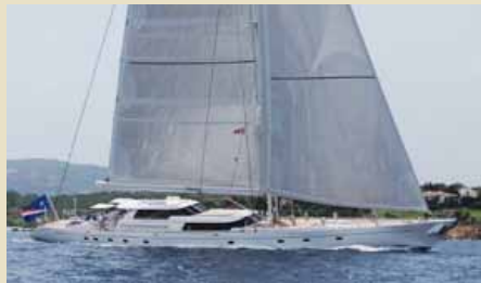
HYPERION 47.42 m 6/8 West Mediterranean – Caribbean 97,000/90,000 €/week