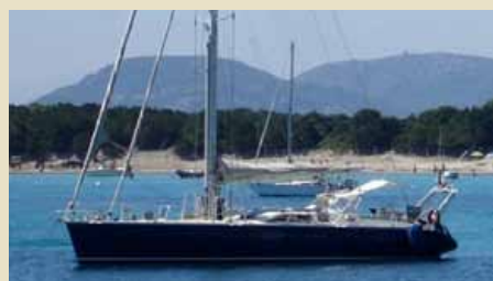
LUAR 040 Passoa 54 Aluminium 16.32 m 2002 Location: Caribbean 330,000 €