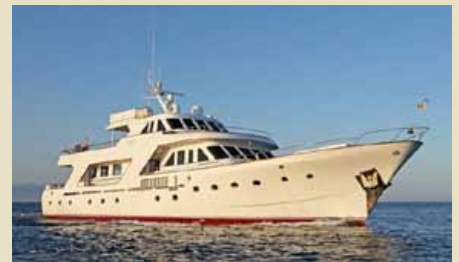
SPREZZATURA 30.30 m 8/5 West Mediterranean 35,000/31,000 €/week