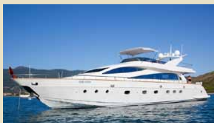
CAROLIN III PerMare Amer 92 28.00 m 2009 Location: Italy 2,245,000 €