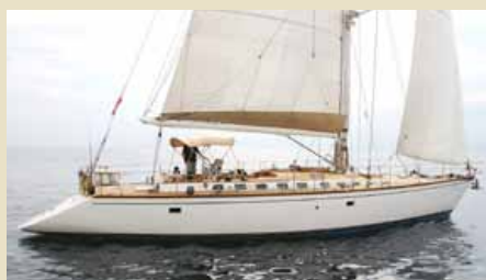
EQUINOX Selestra 64, aluminium 20.54 m 1996/2010 Location: South France 290,000 €