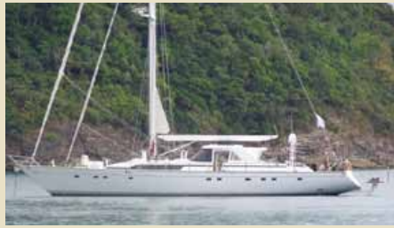
DEMOISELLES maxi 88 Sloop 29.70 m 1989 Location: Brazil 1,200,000 €