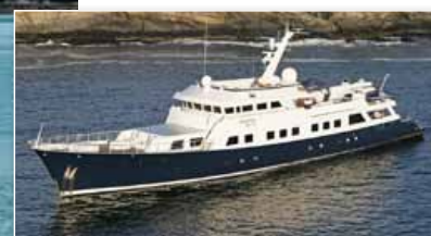
Chantal, p. 5