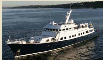
CHANTAL Long Range Luxury Motor Yacht 46.50 m 1984/2013 Location: Turkey 7,900,000 €