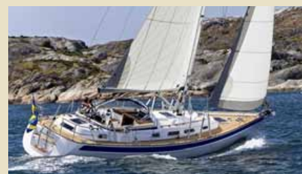
GRACILIA II HR 40 12.40 m 2006 Location: East Med 2 950 000 SEK (Approx. 335 000 €)