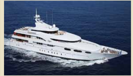
CAPRI 58.55 m 12/15 West Mediterranean 340,000/260,000 €/week