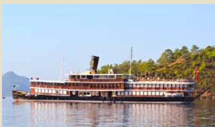
HALAS 50.00 m 24/16 East Mediterranean 105,000/93,000 €/week