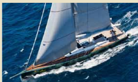
SHAMLOR 20.42 m 6/2 West Mediterranean 20,000/18,000 €/week