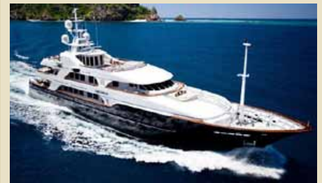
NOBLE HOUSE 53.90 m 12/12 Australia 199,000 USD/week