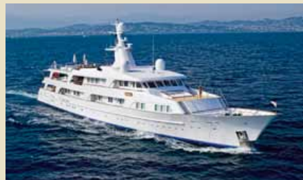
ILLUSION 55.50 m 12/13 West & East Mediterranean 196,000/175,000 €/week