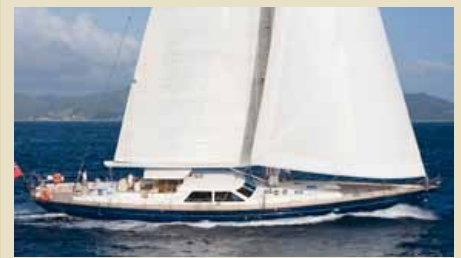
AVENTURA Danish Yacht & Holland Jachtbouw Sloop 33.24 m 2005 Location: Caribbean US$ 4,950,000