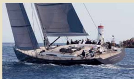
CAPE ARROW 30.20 m 8/4 West Mediterranean – Caribbean Rate (high/low): 50,000/45,000 €/week