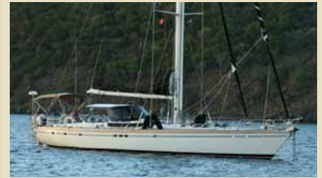
WILD SALMON Locwind 80 24.00 m 1997 Location: Brittany, France 880,000 €