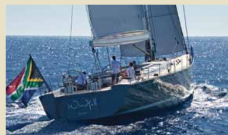
WINDFALL 28.64 m 6+1/4 West Mediterranean 45,000/40,000 €/week