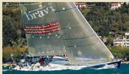
CUBA LIBRE Volvo Ocean 60 19.48 m 1992 Location: Caribbean 220,000 €