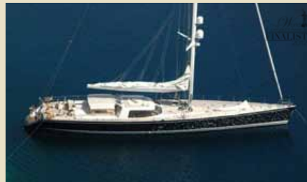
VAIMITI 39.20 m 10/5 East Mediterranean – Caribbean 72,000/67,000 USD/week