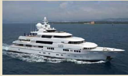
TITANIA 72.00 m 12/21 West Mediterranean 600,000 €/550,000 €/week