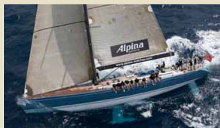
ALPINA 24.89 m 6/3 East & West Mediterranean 25,000 €/week