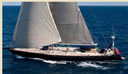
PK BOO II 27.00 m 10/4 West Mediterranean 30,000/24,000 €/week