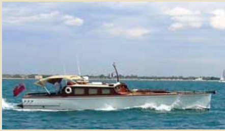
ALLEGIANCE Réplique C&N 1925 14.40 m 2004 Location: South France 330,000 €