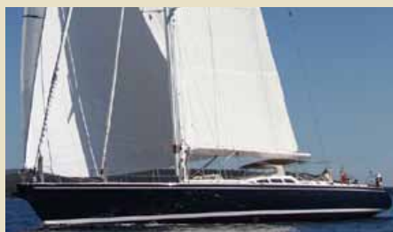
O7 2 - OCEAN SEVEN SQUARED 31.80 m 8/4 Caribbean 49,000 USD/week