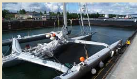
LAKOTA 60ft Orma Trimaran 18.28 m 1990 Location: Grenada 280,000 €