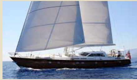
NEPTUNE Fitzroy Aluminium Sloop 25.65 m 2004 Location: Italy 1,750,000 €