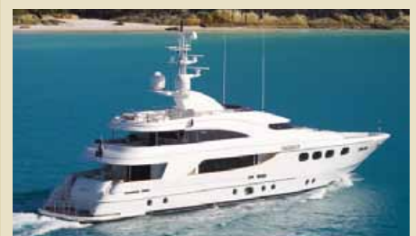
DE LISLE III 42.00 m 10/7 South Pacific, Australia, Fiji 125,000 USD/week