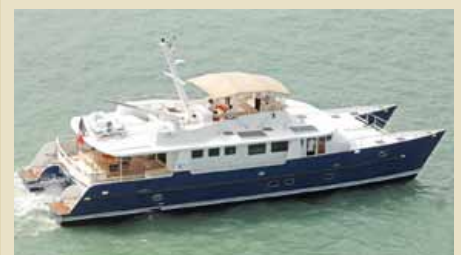
PELICANO Motor Catamaran 23.95 m 2005 Location: South France 1,250,000 €