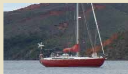
TANGAROA 47ft Pouvreau Meridien 14.25 m 1977 Location: New Zealand 155,000 €