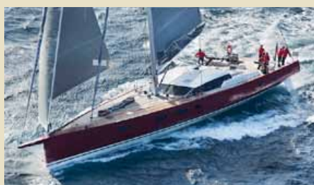
NOMAD IV 30.48 m 12/4 West Mediterranean 56,000/52,000 €/week