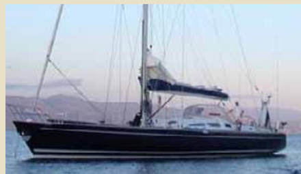
L'ILE NUE Techni Marine Sloop 23.66m 1988 Location: martinique 590,000 €