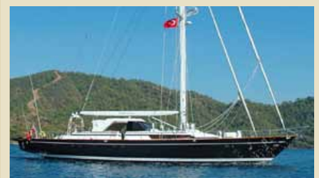
SOUTHERN CROSS Maxi 88 Sloop 29.70 m 1991/2004 Location: Turkey 1,350,000 €