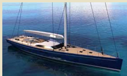
FARFALLA 31.78 m 8/4-5 West Mediterranean – Caribbean 55,000/50,000 €/week