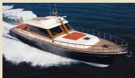
MATHIGO Morgan 70 21.24 m 2007 Location: South France 890,000 €