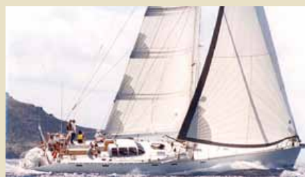
CAPO DI FORA 67ft Cutter Rigged Sloop 20.30 m 1991 Location: Sardinia, Italy 390,000 €