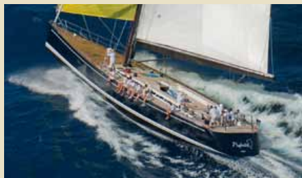
NEFERTITI 27.70 m 8/4 East & West Mediterranean 50,000 USD/week