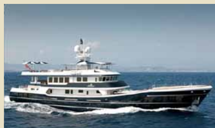
THE MERCY BOYS 49.00 m 12/11 West Mediterranean 115,000/99,000 €/week