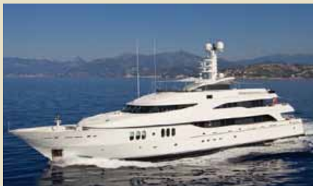
DIAMOND A 57.30 m 12/15 West Med. & Croatia 285,000/255,000 €/week