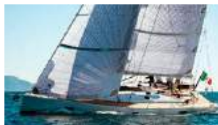
OSCAR 2 Mylius 50 15.32 m 2014 Location: Cogolin, France EUR 590 000