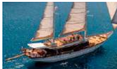
RIANA Length: 42,00 m Guest/Crew: 10/7 Area: West Mediterranean Rate: From EUR 70 000/week