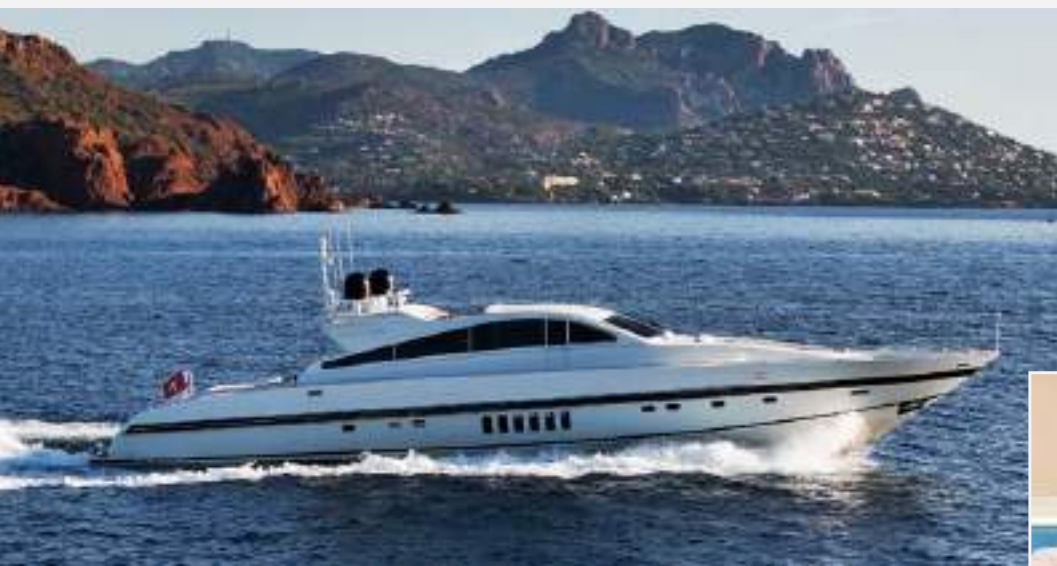
Leopard 27 NOTORIOUS, page 8