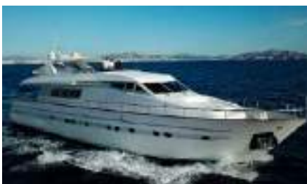
OLA Length: 23.95 m Guest/Crew: 8/2 Area: South of France Rate: From EUR 21 000/week