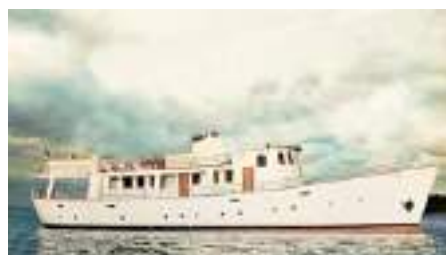
THEMARA Long Range Gentleman Motor Yacht 24.60 m 1962, Refit 2022 Location: Marseille, France EUR 950 000