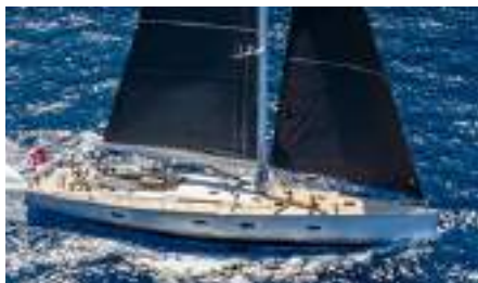
ARAGON Length: 28.64 m Guest/Crew: 8/4 Area: Sardinia Rate: From EUR 44 000/week