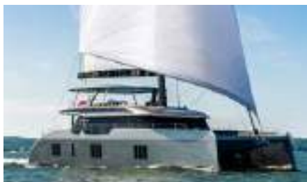
APOLLO 99 Length: 23.87 m Guest/Crew: 8/4 Area: Balearics Rate: From EUR 85 000/week