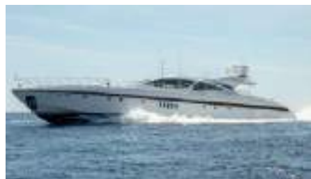
PLAN A Mangusta 130 39.00 m 2007, Refit 2020 Location: Antibes, France EUR 4 499 000