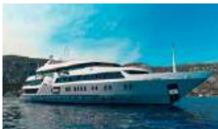
MARQUISE (ex SERENITY) Length: 72.00 m Guest/Crew: 28/29 Area: East & West Mediterranean Rate: From EUR 550 000/week