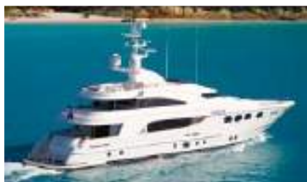
DE LISLE III Length: 42.00 m Guest/Crew: 11/7 Area: Australia Rate: From AUD 165 000/week