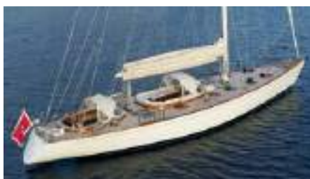
QUARTA SANTA MARIA 83'ft Sangermani 25.40 m 1993, Refit 2021 Location: Varazze, Italy EUR 1 490 000