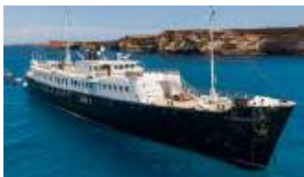
HARMONY Classic Motor Yacht 57.67 m 1955 Location: Valencia, Spain EUR 7 000 000