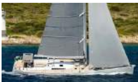
IKIGAI Length: 25.13 m Guest/Crew: 8/2 Area: Caribbean Rate: From EUR 28 000/week