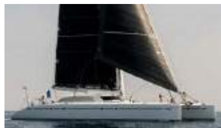
MAGIC CAT Fast Cruising Catamaran 25.00 m 1995, Refit 2022 Location: Saint-Tropez, France EUR 2 900 000