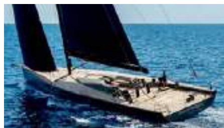
SPIRIT OF MALOUEN X Wally 107 Racer-Cruiser 32.55 m 2012 Location: Palma de Mallorca, Spain EUR 6 900 000