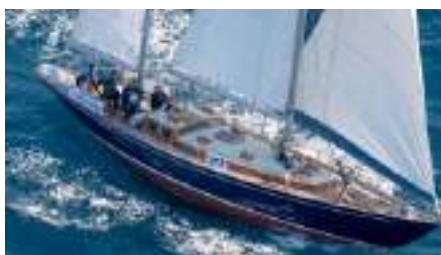
LA CORYPHENE Bermudian Ketch 17.48 m 1958, Refit 2024 Location: Hyères, France EUR 180 000