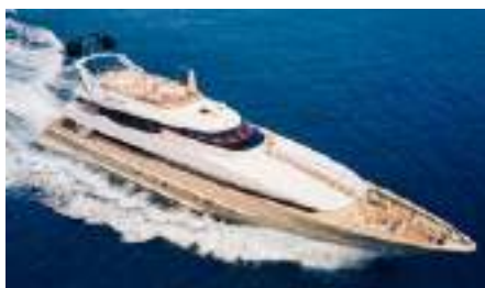
PROMETHEUS I Length: 45.00 m Guest/Crew: 12/10 Area: Greece Rate: From EUR 130 000/week