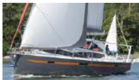
FREYBE 3 JPK 45 FC 13.80 m 2023 Location: Martinique, Caribbean EUR 435 000