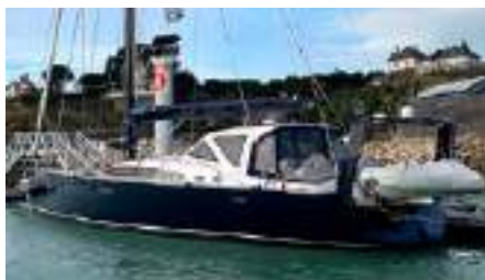
MARY BLUE III Garcia 63 19.20 m 2008, Refit 2023 Location: Brittany, France EUR 1 195 000