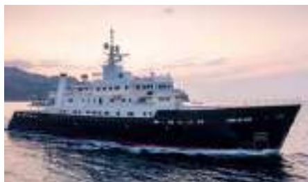
BLEU DE NIMES Length: 72.25 m Guest/Crew: 28/23 Area: East & West Med, Middle East Rate: From EUR 490 000/week