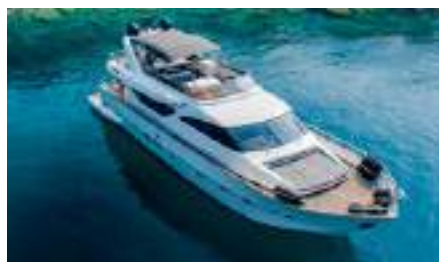
SALTY Length: 23.84 m Guest/Crew: 10/4 Area: Greece Rate: From EUR 30 000/week