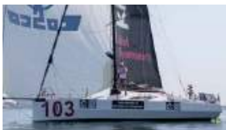
YALA Class 40 12.19 m 2010 Location: Tancarville, France, EUR 120 000