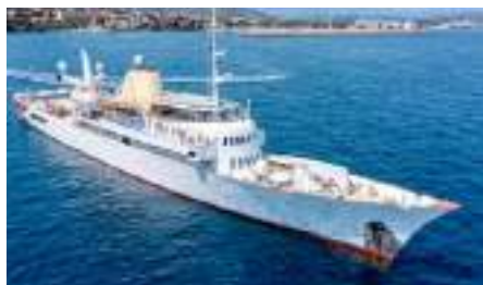
CHRISTINA O Length: 99.13 m Guest/Crew: 34/40 Area: East & West Mediterranean Rate: From EUR 700 000/week