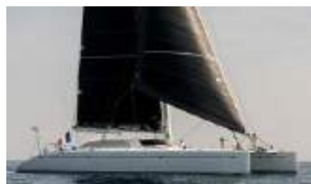
MAGIC CAT Length: 25.00 m Guest/Crew: 8/4 Area: West Mediterranean Rate: From EUR 30 000/week