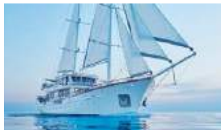
CORSARIO Length: 48,00 m Guest/Crew: 12/18 Area: East Mediterranean Rate: From EUR 65 000/week