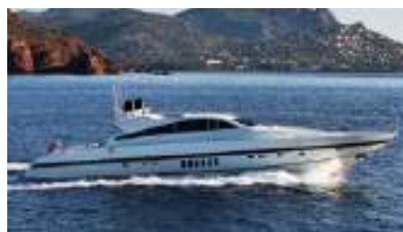
NOTORIOUS Leopard 27 27.00 m 1997, Refit 2023 Location: Saint-Raphael, France EUR 780 000