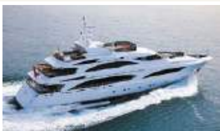
DIANE Length: 43.00 m Guest/Crew: 11/8 Area: Balearics Rate: From EUR 100 000/week