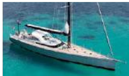
LA LOÉVIE Length: 23.20 m Guest/Crew: 6/3 Area: Caribbean Rate: From EUR 30 000/week