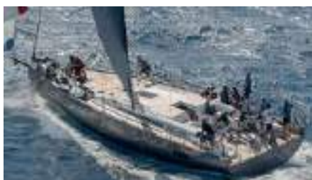
YAGIZA FIRST 53 YACHT 17.12 m 2020 Location: Marseille, France EUR 650 000