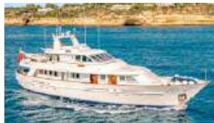
ALDONZA Astilleros de Mallorca Motor Yacht 31.70 m 1995, Refit 2011 Location: Canary Islands - Palma, Spain EUR 2 750 000