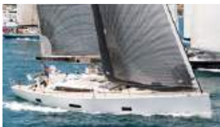
CANTELOUP VIII ICE 62 18.82 m 2014 Location: Port Corbiere, France EUR 950 000