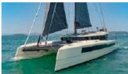
JACK Mc Conaghy 75 23.30 m 2023 Location: Antigua, Caribbean EUR 7 160 640