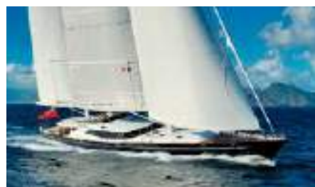
DRUMBEAT Length: 53,00 m Guest/Crew: 10/10 Area: West Mediterranean Rate: From EUR 210 000/week