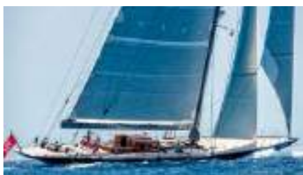
RAINBOW Modern Replica of J Class 39.95 m 2012, Refit 2024 Location: Palma, Spain EUR 9 950 000