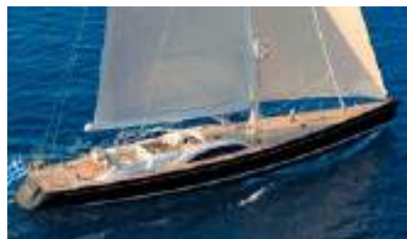
ARISTARCHOS Length: 39,93 m Guest/Crew: 8/6 Area: East Mediterranean Rate: From EUR 75 000/week