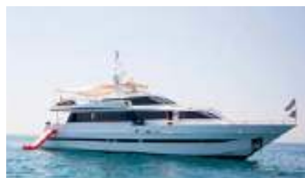
HEARTBEAT OF LIFE Heesen Yachts 28.20 m 1989, Refit 2008 Location: Barcelona, Spain EUR 790 000