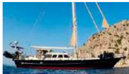
CALEDONIA Oeangoing Centreboard Steel Sloop 18.88 m 2000, Refit 2020 Location: Samos, Greece EUR 555 000