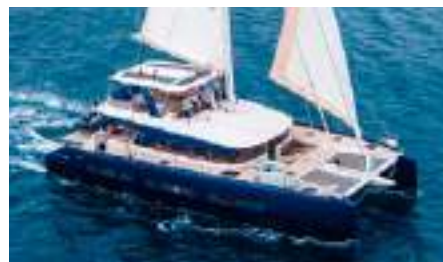
MANE ET NOCTE Length: 23.84 m Guest/Crew: 10/4 Area: Seychelles, Madagascar Rate: From EUR 70 000/week