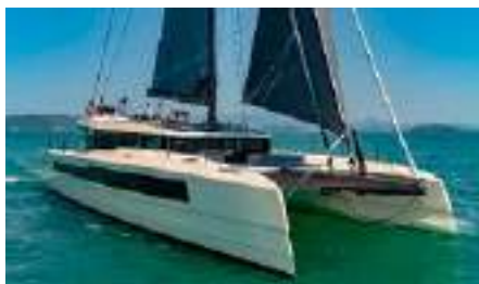
JACK Length: 23.30 m Guest/Crew: 8/4 Area: West Mediterranean Rate: From EUR 65 000/week