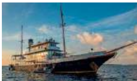
KALIZMA Length: 45.75 m Guest/Crew: 10/11 Area: East/West Mediterranean Rate: From EUR 105 000/week