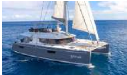
ARAOK Length: 17.80 m Guest/Crew: 6/3 Area: West Mediterranean Rate: From EUR 25 000/week