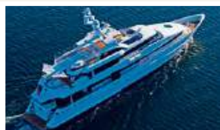
LIFE SAGA Length: 42.10 m Guest/Crew: 12/7 Area: West Mediterranean Rate: From EUR 100 000/week