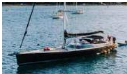
FREE AT LAST Length: 28.80 m Guest/Crew: 8/4 Area: East & West Mediterranean Rate: From EUR 39 000/week