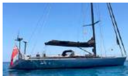
WALLY ONE Length: 25.15 m Guest/Crew: 6/4 Area: West Mediterranean Rate: From EUR 30 000/week