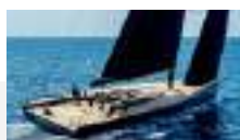
Spirit of Malouen X