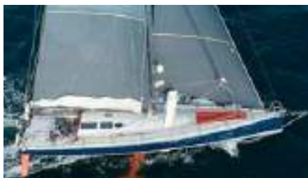
LE PINGOUIN Open 60 18.30 m 1998 Location: Acores, Portugal EUR 95 000