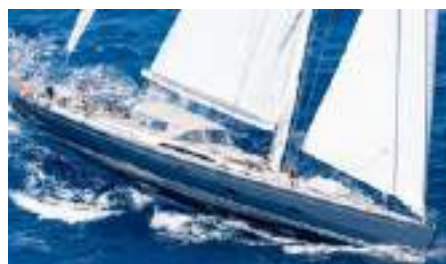
FREEBIRD Length: 30.20 m Guest/Crew: 8/4 Area: Italy, Croatia Rate: From EUR 55 000/week