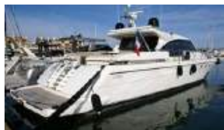
WILD Guy Couach 2100 Open 21.00 m 2007 Location: Saint-Tropez, France EUR 495 000