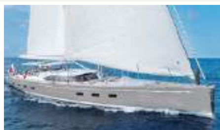
SELENA Length: 31,89 m Guest/Crew: 6/4 Area: West Mediterranean Rate: From EUR 95 000/week