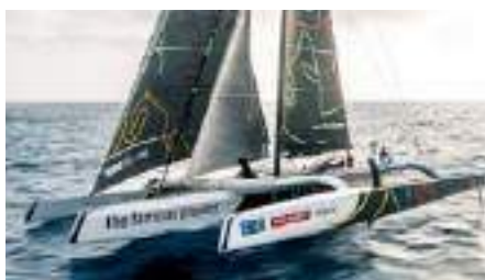
LIMOSA Multi One Design 70 21.20 m 2011 Location: La Seyne-Sur-Mer, France EUR 1 700 000