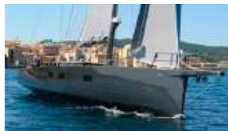
BLACK LEGEND 4 Black Pepper Code 2.1 18.30 m 2019 Location: Port Grimaud, France EUR 1190 000