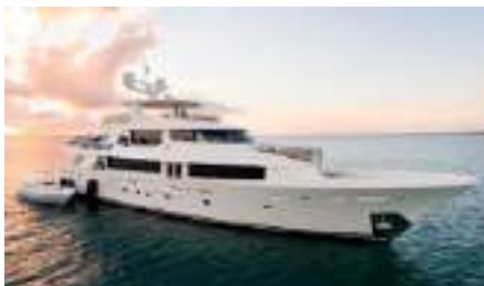
PIPE DREAM Length: 39.62 m Guest/Crew: 10/7 Area: Florida, Bahamas Rate: From USD 140 000/week