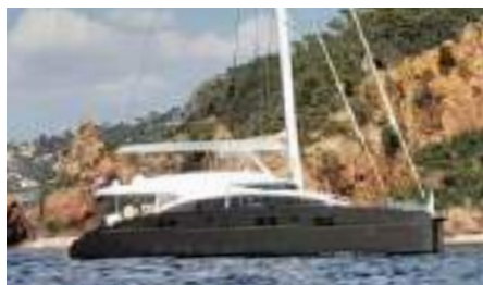
HOUBARA Length: 23.99 m Guest/Crew: 6/3 Area: West Mediterranean Rate: From EUR 34 000/week