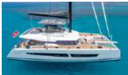
SEMPER FIDELIS Length: 20.42 m Guest/Crew: 6/3 Area: Florida, The Bahamas Rate: From USD 39 000/week