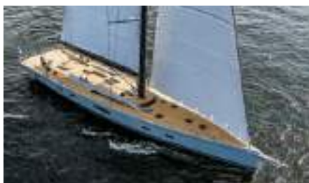
FANCY Length: 32,92 m Guest/Crew: 9/5 Area: West Mediterranean Rate: From EUR 115 000/week