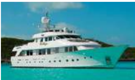
SWEET ESCAPE Length: 39.62 m Guest/Crew: 12/7 Area: The Bahamas Rate: From USD 115 000/week