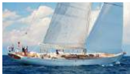
WHITEFIN New Classic Sloop 27.43 m 1983, Refit 2021 Location: Monastir, Tunisia EUR 3 000 000