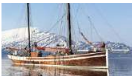
LUN II Norwegian Galeas 20.76 m 1914 Location: Amsterdam, NL EUR 155 000