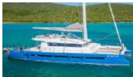
SET ONE Set Marine 625 19.00 m 2016, Refit 2024 Location: Mediterranean EUR 1 100 000