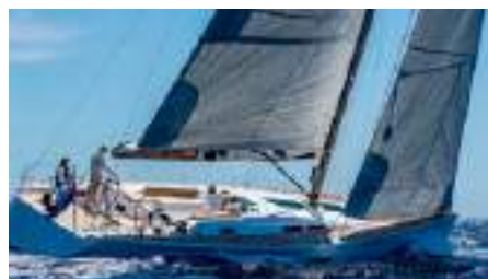
ALBATOR TOO Swan 60-906 Flush Deck Version 18.86 m 2012, Refit 2021 Location: Port Grimaud, France EUR 1 450 000