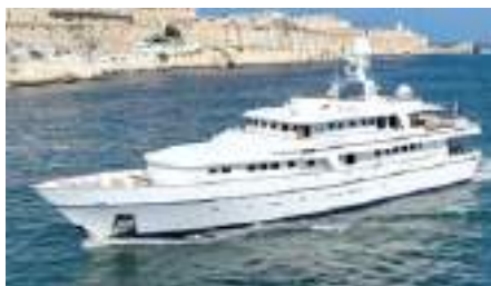
CHEETAH MOON 38m Custom 38.36 m 1986, Refit 2020 Location: Trogir, Croatia EUR 2 390 000