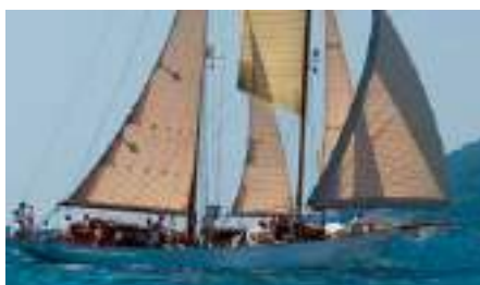
ORIANDA Length: 26.00 m Guest/Crew: 8/3 Area: West Mediterranean Rate: From EUR 28 500/week