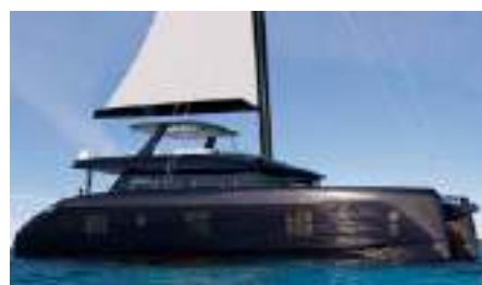
FELICITA Length: 24.00 m Guest/Crew: 10/4 Area: West Mediterranean Rate: From EUR 76 500/week