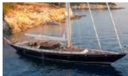
IRELANDA Length: 31,90 m Guest/Crew: 6/4 Area: West Mediterranean Rate: From EUR 42 000/week