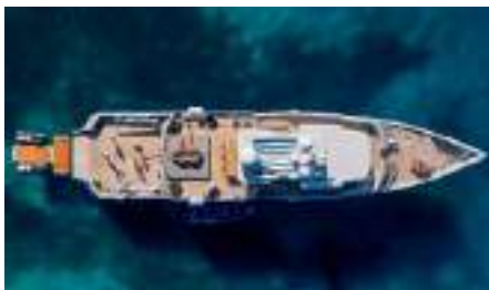
PREFERENCE 19 Length: 36.40 m Guest/Crew: 10/7 Area: East/West Mediterranean Rate: From EUR 100 000/week