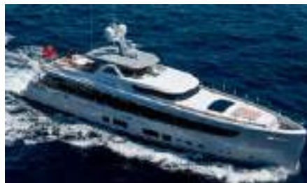
CALYPSO I Length: 36.00 m Guest/Crew: 10/6 Area: East/West Mediterranean Rate: From EUR 152 000/week