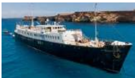
HARMONY Classic Motor Yacht 57.67 m 1955 Location: Valencia, Spain EUR 7 000 000