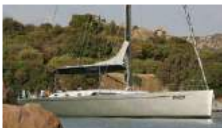
KER RP 59 Fast Cruising Sloop 17.94 m 2005 Location: Toulon, France EUR 495 000