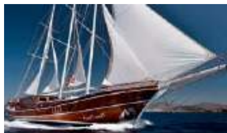
DOLCE VITA Length: 34,00 m Guest/Crew: 10/5 Area: Croatia Rate: From EUR 29 646/week