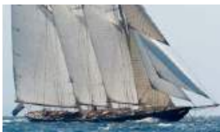
ATLANTIC Length: 64,40 m Guest/Crew: 12/12 Area: Northern Europe, West Med Rate: From EUR 120 000/week