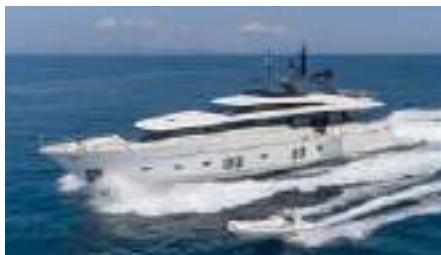
DINAIA Sanlorenzo 106 32.20 m 2018 Location: Athens, Greece EUR 7 450 000