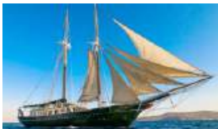
ARKTOS Length: 42,00 m Guest/Crew: 11/7 Area: Greece Rate: From EUR 44 000/week