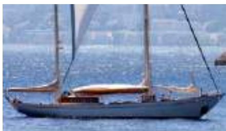
TAMORY Classic Wishbone Ketch 26.58 m 1952, Refit 1974 Location: Ventimiglia, Italy EUR 525 000