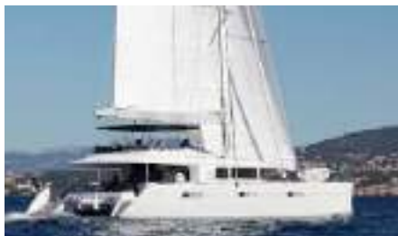
LADY M Length: 18.90 m Guest/Crew: 6/2 Area: West Mediterranean Rate: From EUR 20 000/week