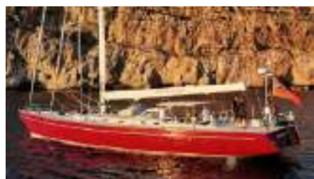
HEIDENSKIP Van de Stadt 84' 25.50 m 2005, Refit 2022 Location: Puglia, Italy EUR 1 330 000