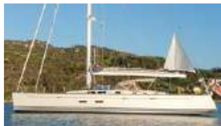
DOS MUCH X-Yachts X-65_05 20.01 m 2010 Location: Valencia, Spain EUR 1 150 000