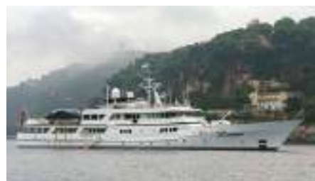
SANSSOUCI STAR Steel/Aluminium Large Motor Yacht 53.53 m 1982 Location: Flensburg, Germany EUR 1 900 000