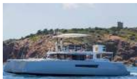
LE PINARELLO NEEL 47 14.20 m 2019 Location: Marseille, France EUR 850 000