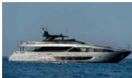
FIGURATI Length: 33.53 m Guest/Crew: 11/6 Area: West Mediterranean Rate: From EUR 137 500/week