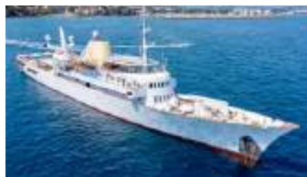
CHRISTINA O Classic Motor Yacht 99.13 m 1943, Refit 2001 Location: France EUR 90 000 000