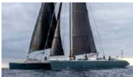
MAXICAT VICTORIA Fast Cruising Maxi Catamaran 33.50 m 2000, Refit 2023 Location: Denia, Spain EUR 1 250 000