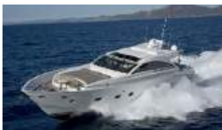
NOE Guy Couach 2800 Open 28.60 m 2013 Location: Port Grimaud, France EUR 1 700 000