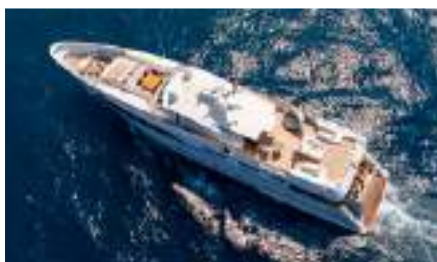
SOPHIE BLUE Length: 41.00 m Guest/Crew: 10/9 Area: West Mediterranean/Croatia Rate: From EUR 85 000/week