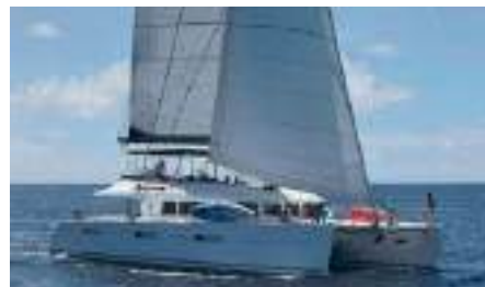
REVE 2 MER Length: 18.20 m Guest/Crew: 8/3 Area: Seychelles Rate: From EUR 28 000/week