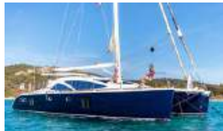
CURANTA CRIDHE Length: 15.35 m Guest/Crew: 6/2 Area: West Mediterranean Rate: From EUR 20 000/week