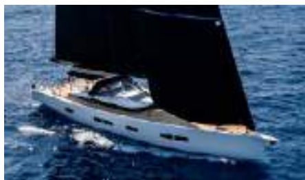
MYSTIC Length: 22.00 m Guest/Crew: 6/1 or 2 Area: France Rate: From EUR 22 500/week