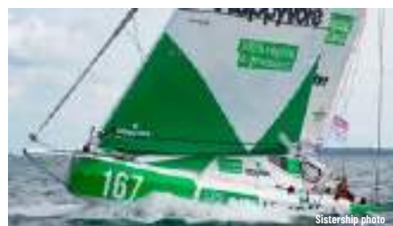
ERNEST Class 40 12.18 m 2021 Location: Le Croustey, France, EUR 510 000