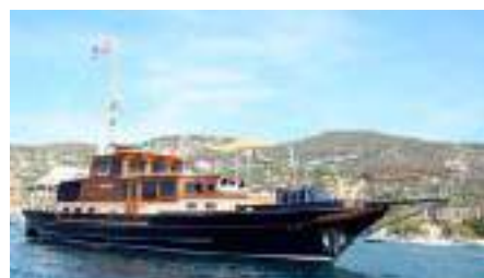
DOLCE VITA Classic 20 20.00 m 2004, Refit 2022 Location: Genoa, Italy EUR 295 000