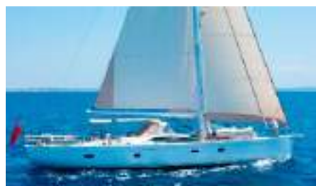
CHAMPAGNE HIPPY Length: 25.15 m Guest/Crew: 8/3 Area: West Mediterranean Rate: From EUR 30 000/week