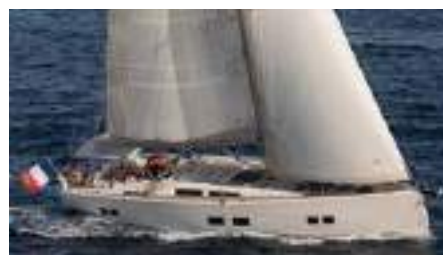
EREMA HANSE 588 17.20 m 2018 Location: Port Saint-Louis du Rhone, France EUR 675 000