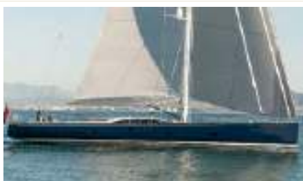
FARFALLA Length: 31,78 m Guest/Crew: 8/5 Area: Northern Europe Rate: From EUR 70 000/week