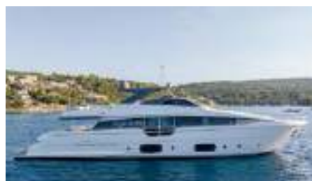
LA FAMILIA II Ferretti 960 29.20 m 2017, Refit 2023 Location: Sibenik, Croatia EUR 5 800 000