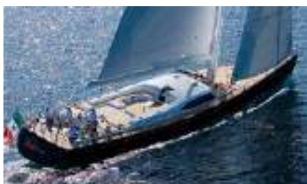
FARANDWIDE Length: 30.20 m Guest/Crew: 8/4 Area: Italy, Croatia Rate: From EUR 58 000/week