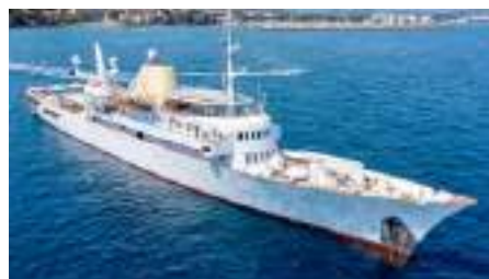
CHRISTINA O Classic Motor Yacht 99.13 m 1943, Refit 2001 Location: France EUR 90 000 000