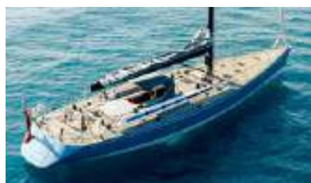
KALLIMA Length: 24.89 m Guest/Crew: 8/3 Area: West Mediterranean Rate: From EUR 34 000/week