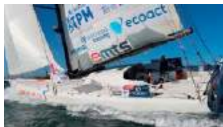
MERCI Imoca 60 18.30 m 2010 Location: Toulon, France EUR 390 000