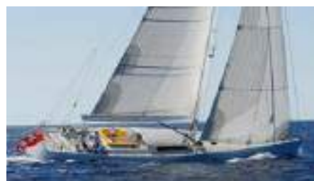
WHIMSY 79 ft Performance Cruising Sloop 23.98 m 2005 Location: Barcelona, Spain EUR 1 390 000