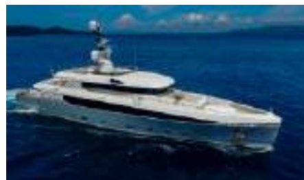
ASLEC 4 Length: 48.00 m Guest/Crew: 10/9 Area: West Mediterranean Rate: From EUR 216 000/week