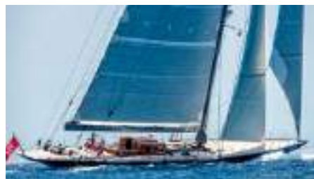
RAINBOW Modern Replica of J Class 39.95 m 2012, Refit 2024 Location: Palma, Spain EUR 9 950 000