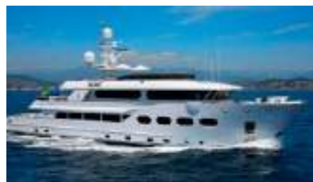
BARON TRENC Eurocraft 142' 43.50 m 2011, Refit 2023 Location: Loano, Italy EUR 9 900 000