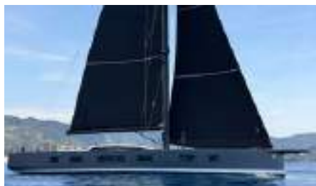
LUCE GUIDA Length: 23.60 m Guest/Crew: 6/2 Area: West Mediterranean Rate: From EUR 24 000/week