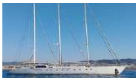
YAMAKAY CMN 39 Modern Schooner 42.36 m 1994, Refit 2014 Location: Sète, France EUR 1 990 000