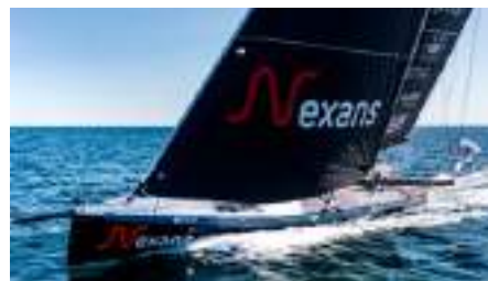
OCEAN CALLING Open 60 18.28 m 2007 Location: Lorient, France EUR 950 000