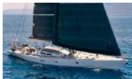
AIZU Length: 30.16 m Guest/Crew: 8/4 Area: The Cyclades, Greece Rate: From EUR 29 000/week