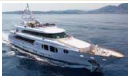
BINA Length: 43.25 m Guest/Crew: 12/10 Area: East Mediterranean Rate: From EUR 175 000/week