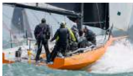
TEAM VISION Cape 31 9.55 m 2023 Location: Hyères, France, EUR 250 000