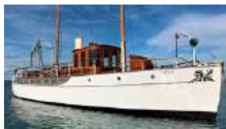
KIWI Motor Gentleman's Yacht 18.30 m 1914, Refit 2023 Location: Sète, France P.O.A.