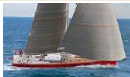
NOMAD IV Length: 30,48 m Guest/Crew: 12/4 Area: West Mediterranean Rate: From EUR 66 000/week