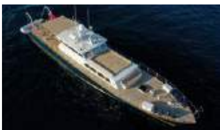
CIUTADELLA Length: 25.66 m Guest/Crew: 6/2 Area: West Mediterranean Rate: From EUR 29 400/week