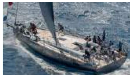
YAGIZA FIRST 53 YACHT 17.12 m 2020 Location: Marseille, France EUR 650 000