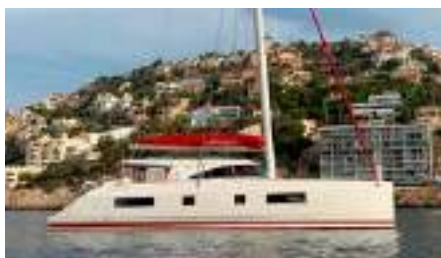
PARADISE Nautitech 542 16.30 m 2012 Location: Canet en Roussillon, France EUR 610 000