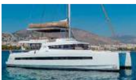
LICENSE TO CHILL Length: 16.80 m Guest/Crew: 10/2 Area: Cyclades, Greece Rate: From EUR 14 350/week