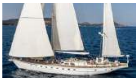
ALTAIR 82 ft Ketch 25.00 m 1987, Refit 2020 Location: Saint-Raphaël, France EUR 790 000