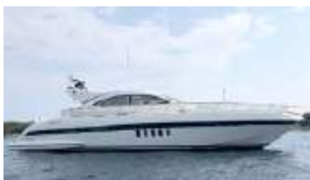
HALKIN Mangusta 72 21.56 m 1999 Location: Alassio, Italy EUR 490 000