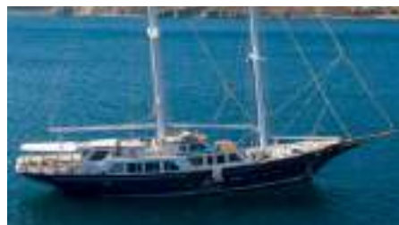
ALTHEA Schooner 37.50 m 1993, Refit 2021 Location: Athens, Greece EUR 950 000