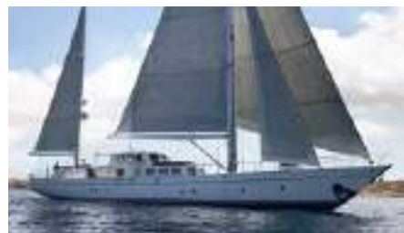
TELSTAR VI 97 ft Alan Buchanan Ketch 29.65 m 1968, Refit 2019 Location: Sète, France EUR 790 000