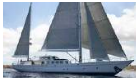
TELSTAR VI 97'ft Alan Buchanan Ketch 29.65 m 1968, Refit 2019 Location: Sète, France EUR 790 000