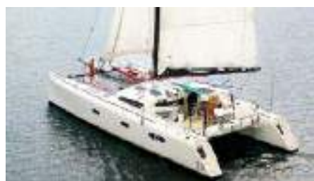
ROSE DE JAVA Marsaudon TS50 Cat 15.24 m 2005 Location: Tahiti, French Polynesia EUR 580 000