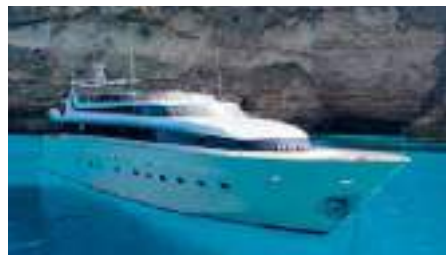
PAULA III Mondomarine 120 38.00 m 1995, Refit 2022 Location: Valencia, Spain EUR 1 495 000