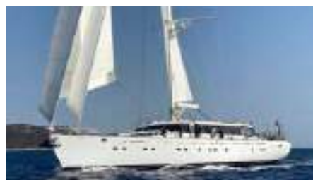
ONYX 2 130'ft Sloop 39.40 m 1990 Location: Sète, France EUR 2 995 000