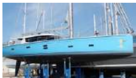
HEOLIA Moody DS 54 17.17 m 2018 Location: Marseille, France EUR 795 000