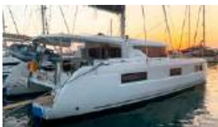
JEAN Lagoon 46 14.50 m 2023 Location: Turkey EUR 850 000