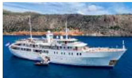
SHERAKHAN Length: 69.65 m Guest/Crew: 26/19 Area: East & West Mediterranean Rate: From EUR 595 000/week