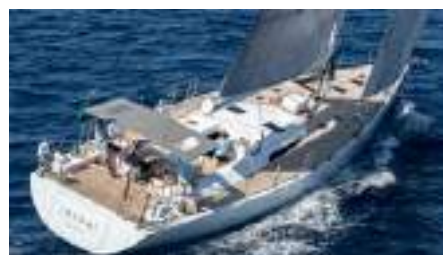
IKIGAI JFA 82 Sloop 25.13 m 2001, Refit 2018 Location: Palma, Spain EUR 2 100 000