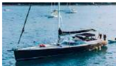
FREE AT LAST 28m Sailing Yacht 28.80 m 2001, Refit 2025 Location: Palermo, Sicilia, Italy EUR P.O.A