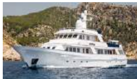
MONACO Feadship Royal Van Lent Shipyard 37.95 m 1981, Refit 2023 Location: Sicilia, Italy, Barcelona EUR 5 600 000