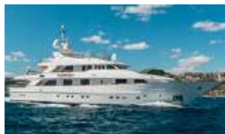
DESAMIS B Length: 40.00 m Guest/Crew: 11/8 Area: West Mediterranean Rate: From EUR 102 000/week