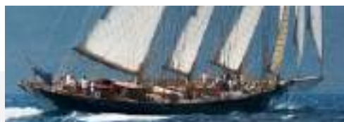
212 th New Classic Schooner ATLANTIC Length: 64.50 m