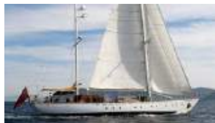
WINDWEAVER OF PENNINGTON One off Design Ketch 25.69 m 1998, Refit 2021 Location: Sète, France EUR 750 000