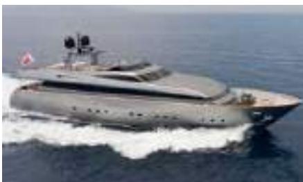
IROCK Length: 34.00 m Guest/Crew: 11/6 Area: West Mediterranean Rate: From EUR 84 000/week