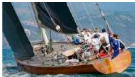
CHANCEGGER International 12 Metre 19.13 m 1969 Location: Brazil EUR 494 416