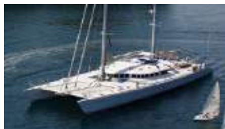
DOUCE FRANCE Two Masted Catamaran Schooner 42.20 m 1998, Refit 2015 Location: French Polynesia, France P.O.A.