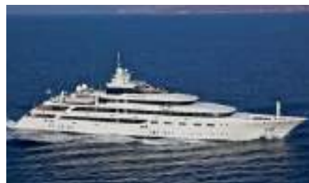
TITANIA Length: 73.00 m Guest/Crew: 12/21 Area: West Mediterranean Rate: From EUR 645 000/week