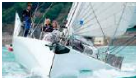
FUJI Cruising converted ex Imoca 60 18.28 m 1992, Refit 2022 Location: Saint-Malo, France EUR 300 000