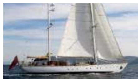
WINDWEAVER OF PENNINGTON One off Design Ketch 25.69 m 1998, Refit 2021 Location: Sète, France EUR 750 000