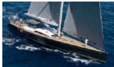
YCH2 Length: 27.71 m Guest/Crew: 8/4 Area: East & West Mediterranean Rate: From EUR 45 000/week