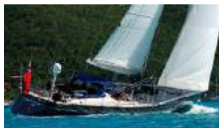
DARK STAR OF LONDON Length: 27.50 m Guest/Crew: 10/3 Area: WestMediterranean Rate: From EUR 32 000/week