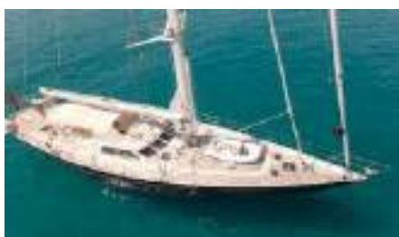
TIGA BELAS Length: 24.59 m Guest/Crew: 8/2 Area: UK (& Northern Ireland) Rate: From EUR 22 000/week