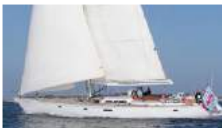
DJANGO TOO Cutter Rigged Sloop 25.00 m 1991, Refit 2022 Location: Cannes, France EUR 1 650 000