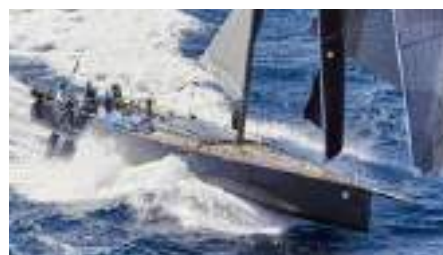
SPIRIT OF LORINA Botin 65 20.00 m 2015 Location: France EUR 1 980 000