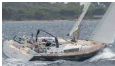
ONE Oceanis 60 18.24 m 2015 Location: Saint-Tropez, France EUR 410 000