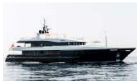
AMADEUS I Length: 44.05 m Guest/Crew: 10/9 Area: West Mediterranean Rate: From EUR 180 000/week