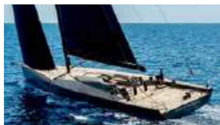
SPIRIT OF MALOUEN X Wally 107 Racer-Cruiser 32.55 m 2012 Location: Palma de Mallorca, Spain EUR 6 900 000