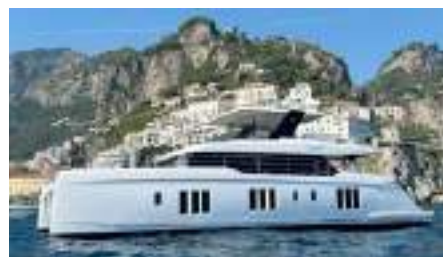
ALMA DIVA Sunreef 70 Power 21.26 m 2022 Location: Cartagena de Indias, Colombia EUR 5 499 000