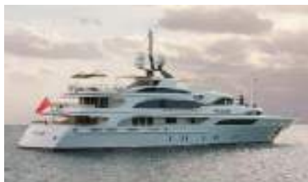
GALAXY Length: 56.00 m Guest/Crew: 12/15 Area: East & West Mediterranean Rate: From EUR 290 000/week