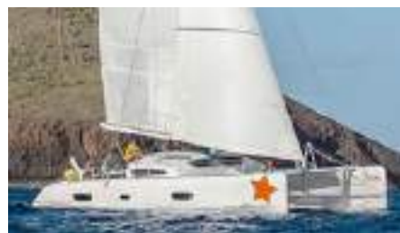
PAMPERO TS 52.8 16.10 m 2011, Refit 2016 Location: Marseille, France EUR 495 000