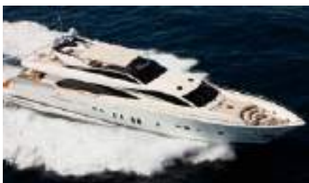
LADY EMMA Length: 34.10 m Guest/Crew: 8/4 Area: West Mediterranean Rate: From EUR 69 000/week