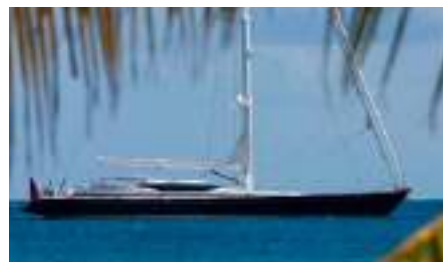
THANDEKA Length: 37,00 m Guest/Crew: 8/6 Area: South Africa..., Morocco Rate: From EUR 85 000/week