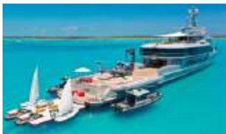
BOLD Length: 83.30 m Guest/Crew: 12/20 Area: East & West Mediterranean Rate: From EUR 875 000/week