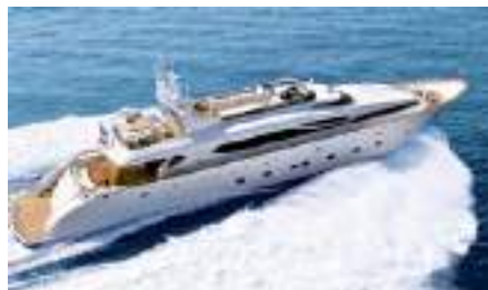
ASCENSION Length: 37.00 m Guest/Crew: 10/5 Area: West Mediterranean Rate: From EUR 100 000/week