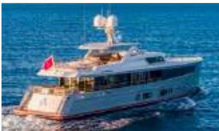
DELTA ONE Length: 36.00 m Guest/Crew: 10/6 Area: Balearics Rate: From EUR 145 000/week