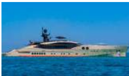
DB9 Length: 52.40 m Guest/Crew: 10/11 Area: West Mediterranean Rate: From EUR 265 000/week