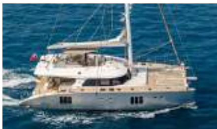
SEAZEN II Length: 21.40 m Guest/Crew: 8/4 Area: West Mediterranean Rate: From EUR 32 000/week