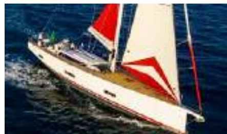
PURA FOLLIA Length: 21.00 m Guest/Crew: 6/2 Area: Italy Rate: From EUR 15 000/week