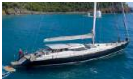
RADIANCE Length: 37,00 m Guest/Crew: 8/5 Area: Pacific Ocean Rate: From AUD 95 000/week