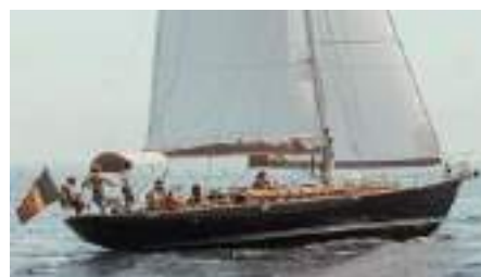
LAZY DAYS Cruising TM 52 15.85 m 2004 Location: Marseille, France EUR 250 000