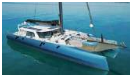
MY CAT Gunboat 78 23.77 m 2016 Location: Barcelona, Spain EUR 4 225 000